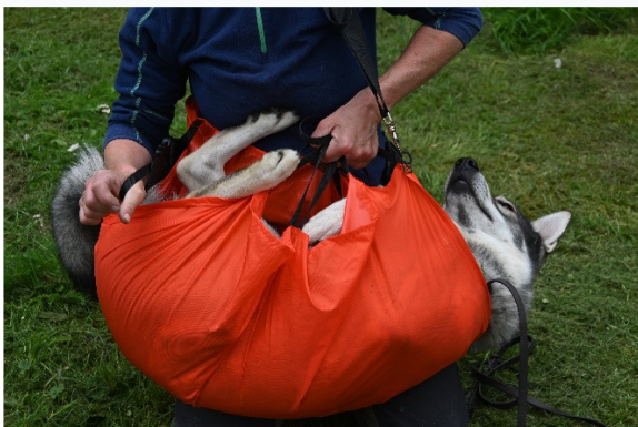
Adjust the shoulder strap.